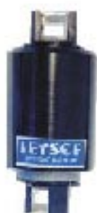
FOI 5/57 & FOI 5/771