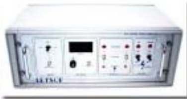
250 Series High Voltage Video Amplifier

This is a linear Class A output video amplifier with a maximum differential output of 275V over the range d.c. to 7MHz. The two outputs can also be set to \pm 250\text{V} dc relative to each other using a bias control. This facility allows an electro-optic amplitude modulator to be set to any desired light output intensity level for any input signal level. This output bias does not introduce any limit to the signal output range.