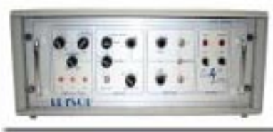
5000 Series High Voltage Linear Differential Amplifier

This 5000V series linear amplifier has been designed to drive large aperture electro optic modulators. It consists of two 0.4 - 3.0 kV linear amplifiers that together produce a differential output that can be connected to either side of the modulator. This produces an optical phase change equivalent to the output from a single sided 5000V unit.